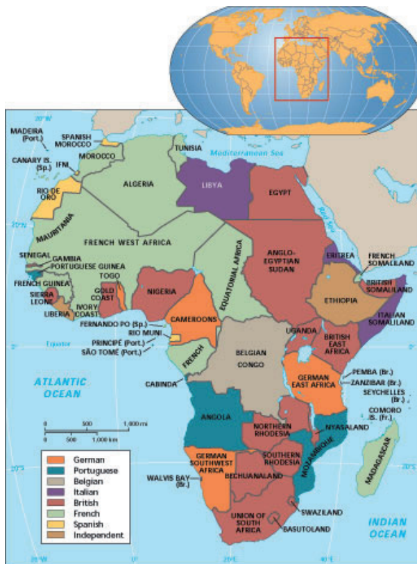
Source: Map of Africa showing the colonial divisions after the Conference of Berlin (1885) as in mhhe.com